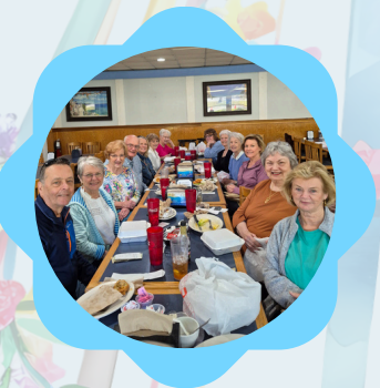
Adult Fellowship took a trip to the State Farmers Market on April 10th followed by lunch at Oceanview Seafood Restaurant in Cayce.