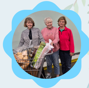
UWF volunteers at Harvest Hope Food Bank.